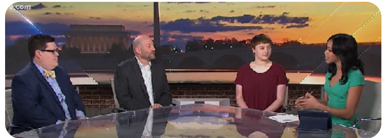
abilIT in the news: Featured on Fox 5 & WUSA 9

Cybrary is the largest massive open online course (MOOC) in the IT space. Cybrary's size, proximity to Melwood, and its list of established employer clients gives it an advantage over other MOOCs. Cybrary's clients include 96% of the Fortune 1000 and 2.5 million users.