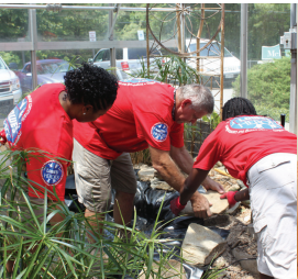
Three Lowe's Heroes volunteers rebuild the pond in Melwood's conservatory to provide moisture to plants in the building.