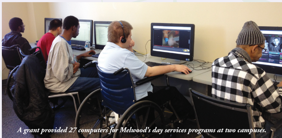
A grant provided 27 computers for Melwood's day services programs at two campuses.

Melwood also received an $88,000 Prince George's County Community Development Block Grant to renovate the bathrooms in the Copus Training Center (CTC) to increase accessibility and meet the needs of the changing population in Melwood's Crossroads program, which impacts 177 people daily. Completion of the project is slated for spring of 2013.