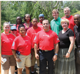
Nine Lowe's Heroes volunteered at Melwood in July helping to construct raised garden boxes and rebuild the pond in the conservatory.